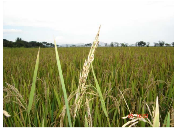
Disease complex of the mite Steneotarsonemus spinki , Burkholderia glumae , and Sarocladium oryzae